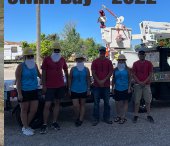
Swim Day - 2022