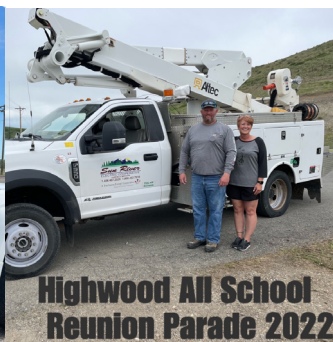
Highwood All School Reunion Parade 2022