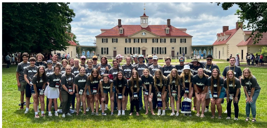
The 2022 Youth Tour group poses at Mount Vernon.