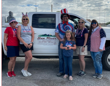
Choteau - 4th of July 2022