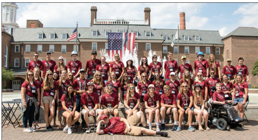
2017 Youth Tour participants pose for a picture in Old Alexandria.